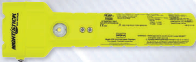
Dual-Switch Control Contrôle -Switch double Control de -Interruptor Dual